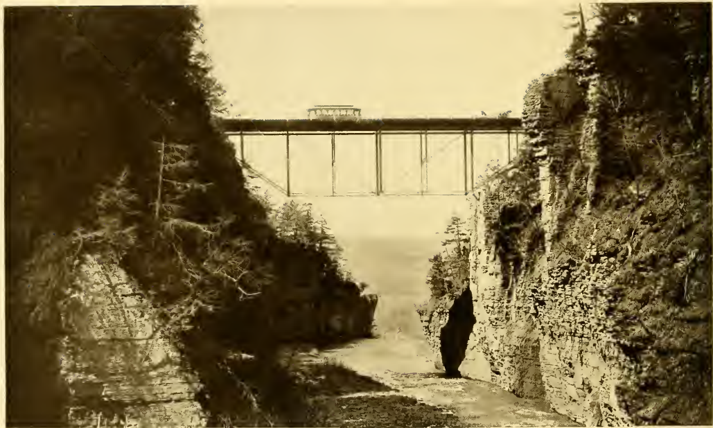
THE NORTH GORGE